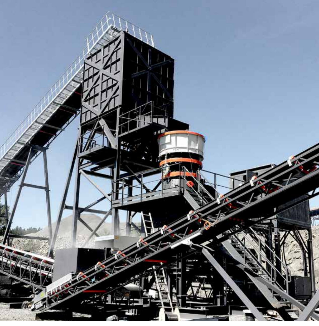
Read more and explore Sandvik CS550 at construction.sandvik.com/cs550