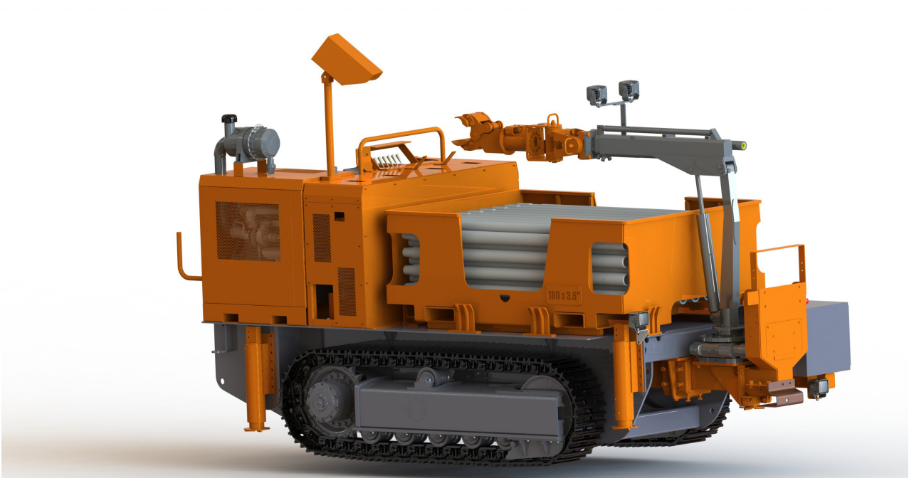
1. SANDVIK DA201 - DRILL PIPE HANDLER